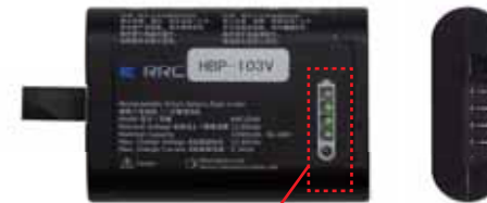
Battery level display

Battery provides approximately 3 hours of continuous operation. An LED confirms the remaining battery charge level.